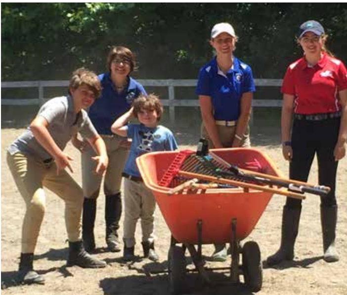
Pony Club camps teach ALL aspects of horse care, and campers find it is all fun.

You may join Pony Club so you can attend one of our summer camps. Email VRPCmembership@gmail.com and let our Membership Coordinator help you find a local club or center that's a right fit for you. You can also find more information about membership on page 50 in this issue of Horse Times or on our website.