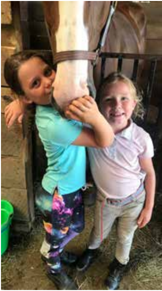
Two Pony Club campers enjoy an afternoon nuzzle.

PC Camp.....from p. 51 Camp is first and foremost an opportunity for education in all things equine.